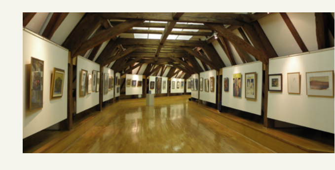
Art lovers can visit the museum and art galery in the "Old Town"

The "Sands of Đurđevac also know as the Sahara of Croatia.